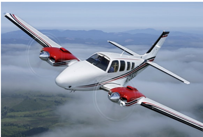
Beechcraft Baron G58 - now EASA certified

A 5-year warranty on structure and all Hawker Beechcraft parts plus a 3-year or 1000 hour warranty on Continental engines complement the deal.